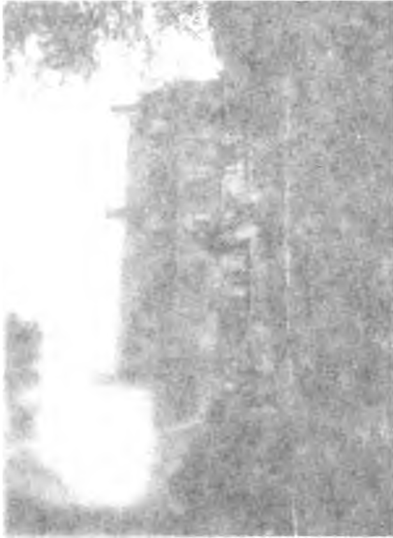
NEAR THE ...